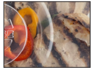
Excellent food visibility

Offer Sustainability that Consumers Value