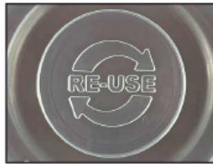
Snap-tight, push-button close