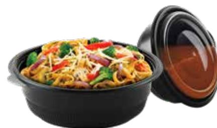
Polypropylene Holds Heat and Prevents Leaks

Better packaging is an investment in protecting customer acquisition costs and securing the next order. It is also something consumers value. 58% of all adults say they'd be willing to pay a little more for upgraded packaging. This number jumps to over 70% for those that choose takeout and delivery most – consumers 18 to 41 (Gen Z adults and Millennials). A 2% premium on the order price will cover the increased investment in packaging for most operators.