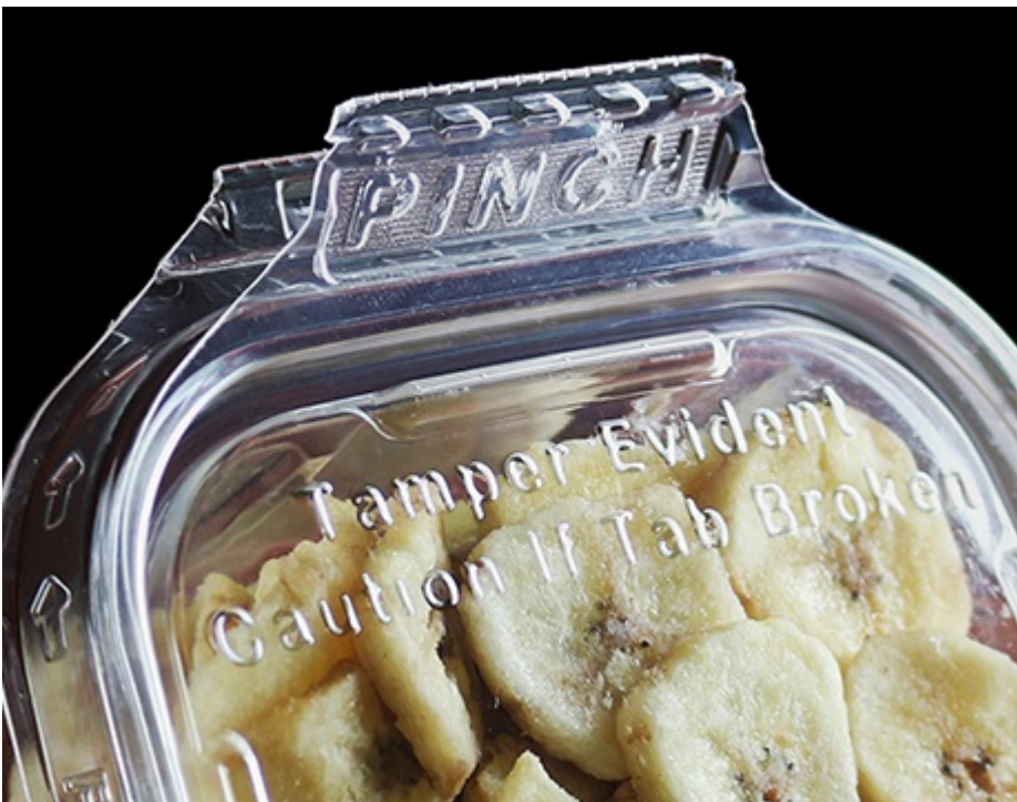
Consumer Alert Message