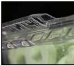
Tamper-Evident Raised Hinge