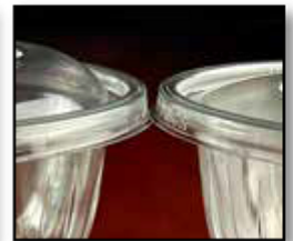
Two Lid Options