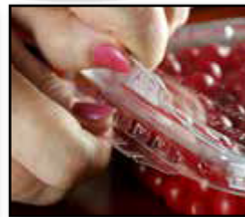
Easy-Opening Hinge Tabs