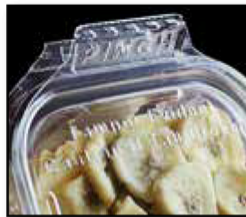
Consumer Alert Message