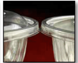
Simple One-Step Opening