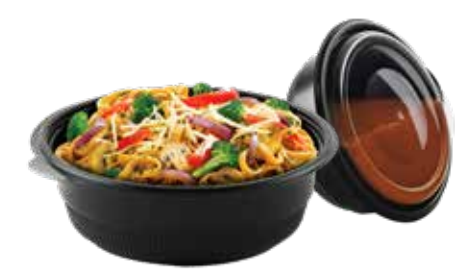
Polypropylene Holds Heat and Prevents Leaks

Better packaging is an investment in protecting customer acquisition costs and securing the next order. It is also something consumers value. 58% of all adults say they'd be willing to pay a little more for upgraded packaging. This number jumps to over 70% for those that choose takeout and delivery most – consumers 18 to 41 (Gen Z adults and Millennials). A 2% premium on the order price will cover the increased investment in packaging for most operators.