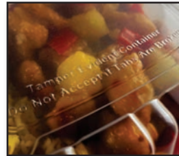
Consumer Alert Message