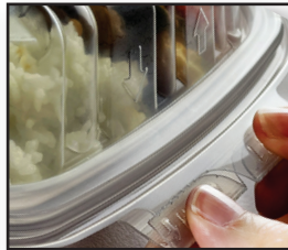
Intuitive Opening Tabs